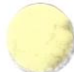
32.4226 crystal gelb