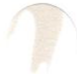
32.4194 army sand