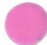
32.4299 crystal fuchsia