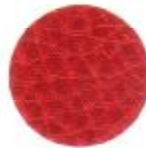
32.4191 leder rot