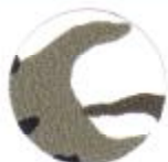
32.4197 army khaki