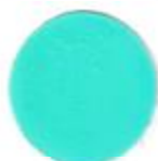
32.4268 crystal grün