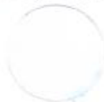
32.4298 crystal transparent