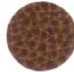
32.4192 leder braun