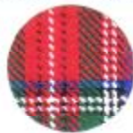
32.4190 schotten rot